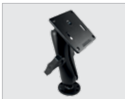
Ball joint mount