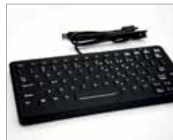
Fully Sealed Keyboard