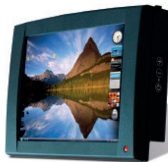
Model: JLT10021 CPU: VIA 1000 MHz 512MB RAM, 60GB HD, Touch Screen, Custom front

When installing advanced equipment on ships, EU's Marine Equipment directives must be followed. For computers, the IEC standard 945/60945 is applicable. To meet the requirements for certification, JLT developed a marine computer for Rolls Royce. After extensive testing, our product solution was chosen due to hardware features, quality and durability but mostly because the service and support corresponds to Rolls Royce's demands.